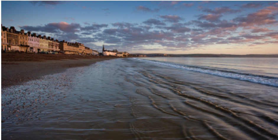
Sunrise at Weymouth.