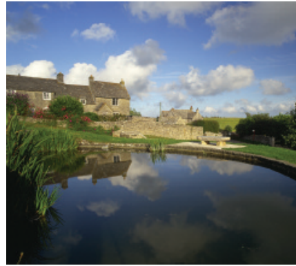
Above: The duck pond at Worth Matravers, a picturesque village in Purbeck.