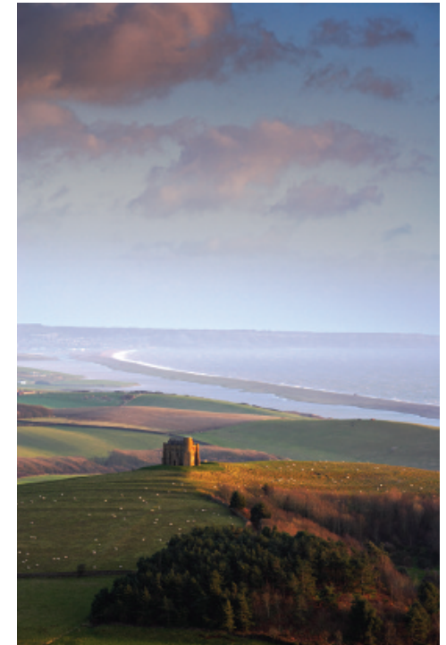
Right: St. Catherine's Chapel, Abbotsbury, in late afternoon sunlight.