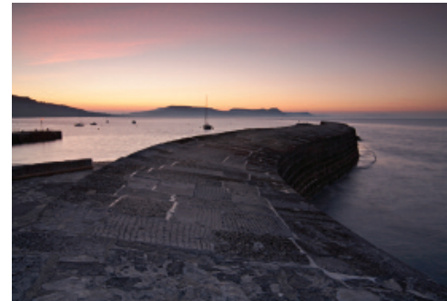
Above: The Cobb, Lyme Regis, at dawn.